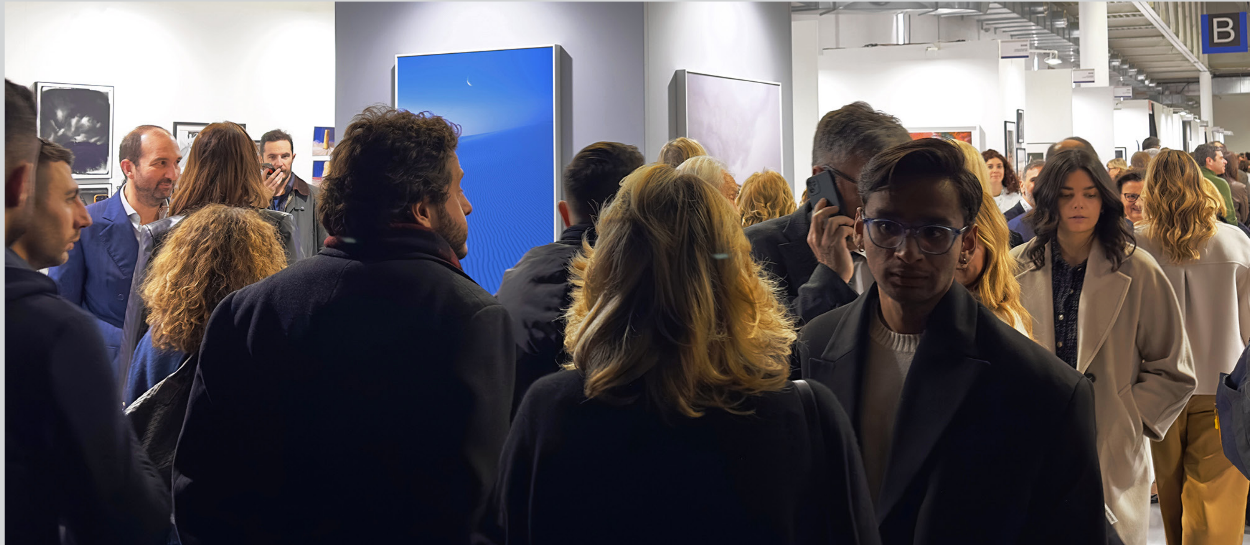
MIA PHOTO FAIR, MILAN, ITALY, MARCH 2025