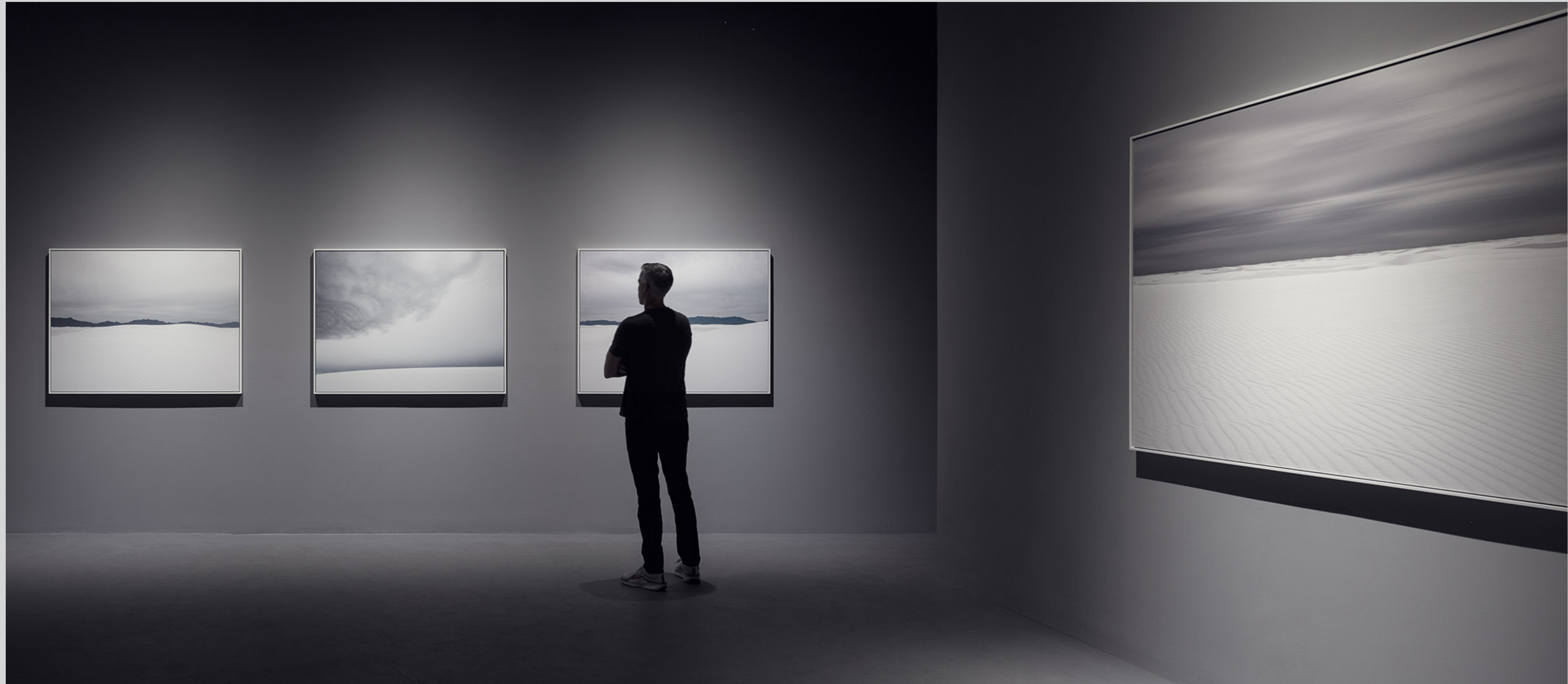
DESERT| MODERN EXHIBITION, THE ELEMENTAL, PALM SPRINGS, CALIFORNIA, FEBRUARY 2025 (54x41 INCH EDITION PRINTS ON THE BACK WALL)